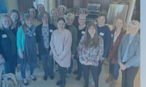
Worship Celebration with Festive Reception following Third Reformed Church, 111 W. 13th St. Holland, MI

CELEBRATING FIVE DECADES OF RCA WOMEN'S ORDINATION AS ELDERS, DEACONS AND MINISTERS!